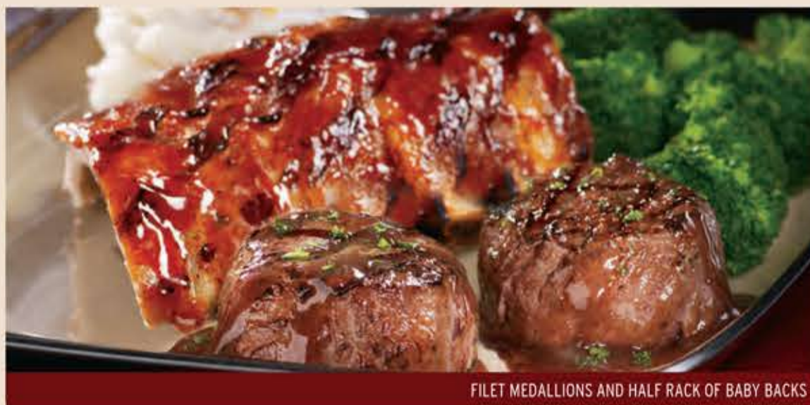
FILET MEDALLIONS AND HALF RACK OF BABY BACKS