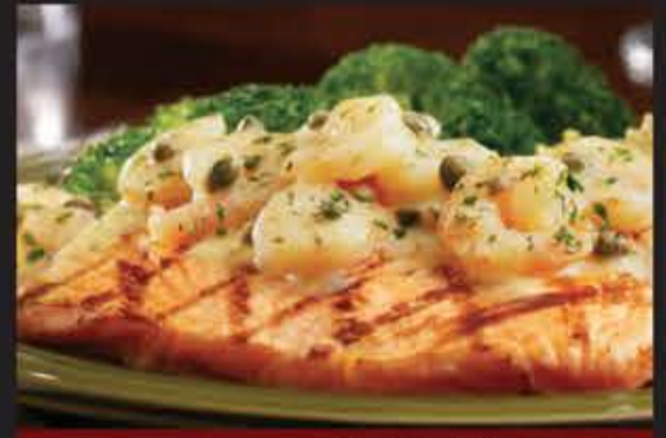
SHRIMP & SALMON PICCATA

Grilled salmon, shrimp, lemon caper wine sauce served with wild rice and steamed broccolis. With Tilapia