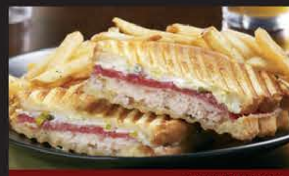
NOLITA DELI PANINI

Grilled chicken breast, melted cheese, bacon, tomato, romaine lettuce, red onion rings, in a toasted bun served with honey & mustard.