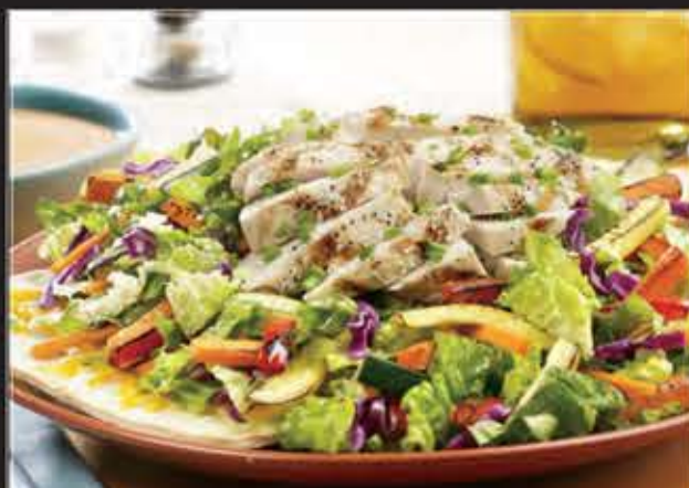
GRILLED CHICKEN & FIRE-ROASTED VEGETABLE SALAD

WHITE SANGRIA RED SANGRIA STRAWBERRY LEMONADE