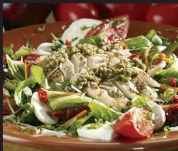
CHICKEN PESTO SALAD

House Salad. RS 19.90 Caesar Dinner Salad.