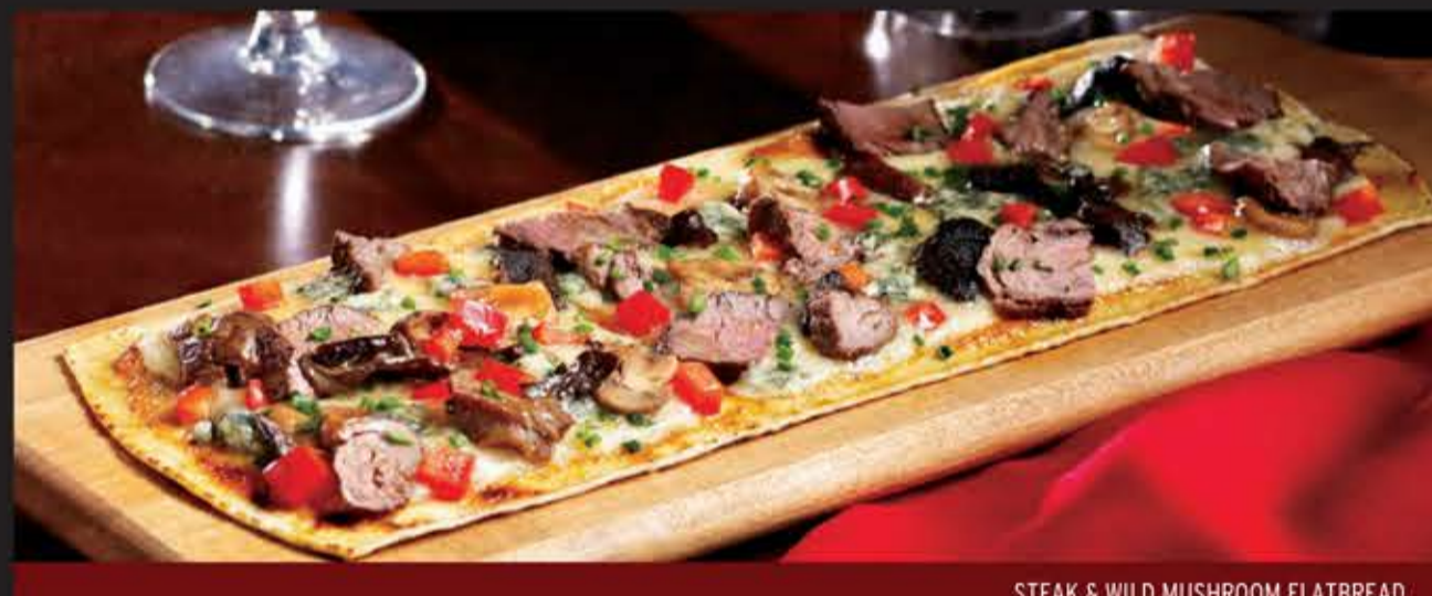
STEAK & WILD MUSHROOM FLATBREAD

A grilled, 100% natural Angus Rump burger topped with Mozzarella cheese, sauteed wild mushrooms, lettuce, tomato and pickles.