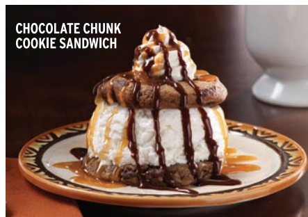
CHOCOLATE CHUNK COOKIE SANDWICH

Vanilla ice cream nestled between two warm chocolate chunk cookies, topped with caramel, chocolate sauce and whipped cream.