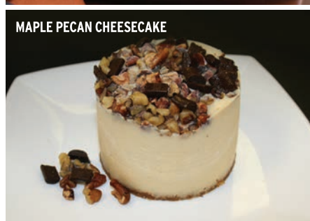
MAPLE PECAN CHEESECAKE

This cheesecake is made with Canadian Maple Syrup and pecans on a graham cracker crust.