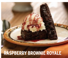
RASPBERRY BROWNIE ROYALE

Why choose one luscious dessert when you can have three? Tony's Dessert Trio lets you sample three delicious mini desserts to finish your meal in grand style.