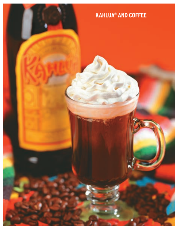
KAHLUA® AND COFFEE