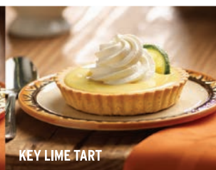
KEY LIME TART