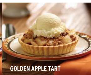
GOLDEN APPLE TART